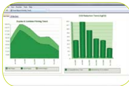
Translate usage data into reports that detail CO 2 reduction trends