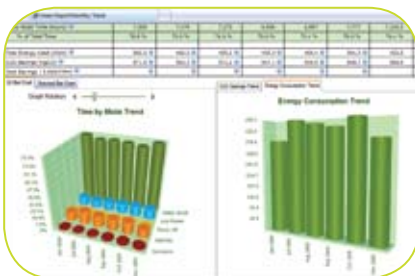
Track trends in energy consumption over time